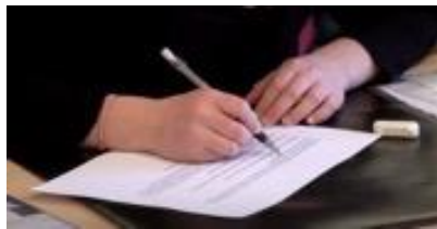
Figure 1. A student is underlining unusual words

The teacher starts by telling the students to underline the words in the text that they find a bit unusual and difficult to understand, and she goes on reading the text aloud.